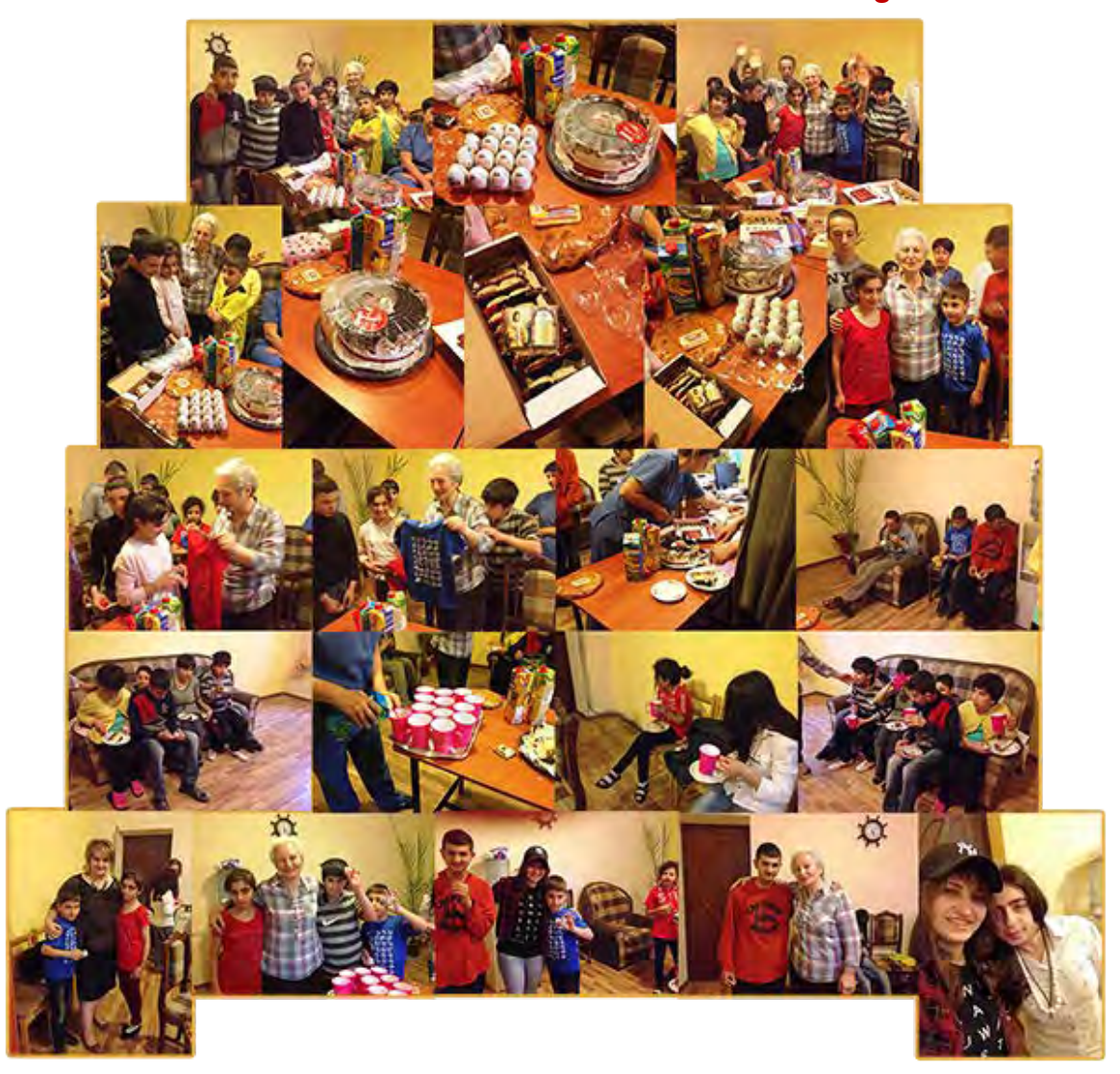
May 2016: The children at Nubarashen received treats and gifts