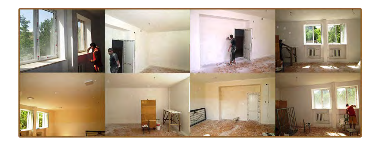
July 2016: New dance room at Vardashen